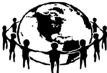
World Communion Sunday

Come! Partake of the meal that God has prepared for you!