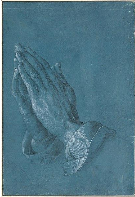
“(The Praying) Hands,” 1508, Albrecht Dürer (1471-1528), The Albertina Museum, Vienna, Austria

107 Staley Ave. Butler, PA 16001 724-287-7731 covenantoffice@zoominternet.net Worship with us on YouTube: CovenantTV1813