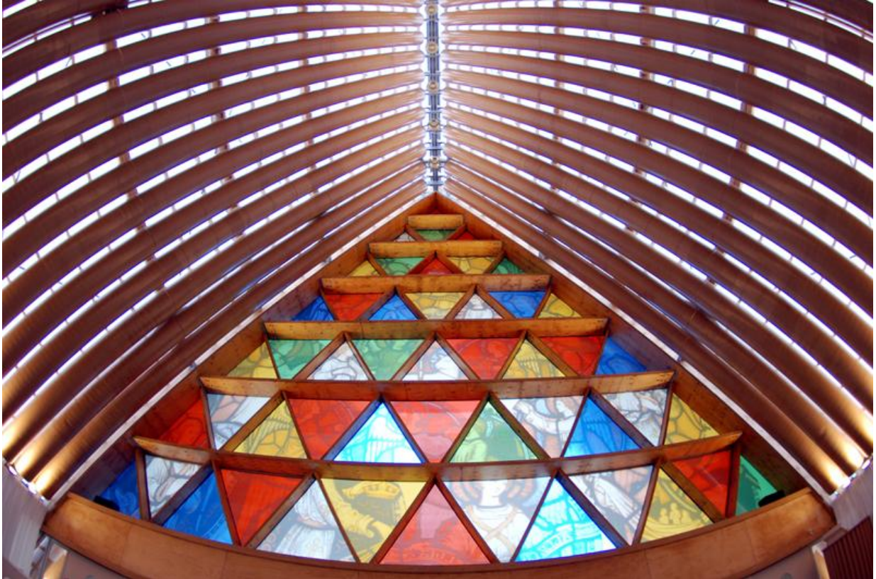
"Cardboard Cathedral," transitional Christchurch Cathedral, Christchurch, New Zealand, Shigeru Ban, architect ☩

Worship with us on YouTube.com/@CovenantTV1813